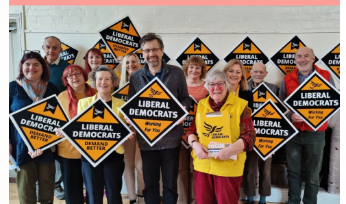
Local members at the Campaign Launch