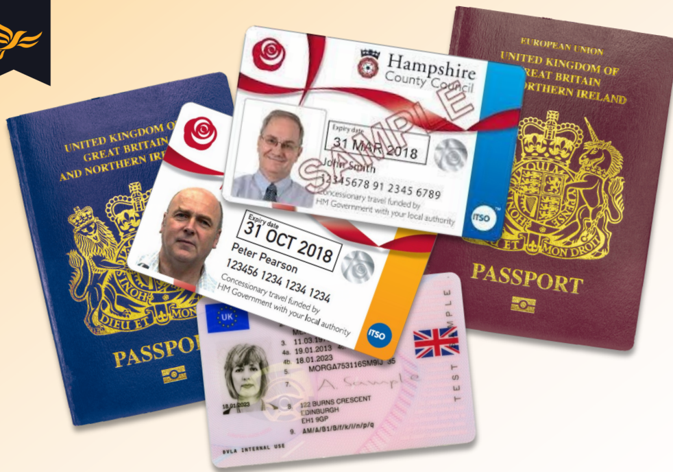
Photo ID is now