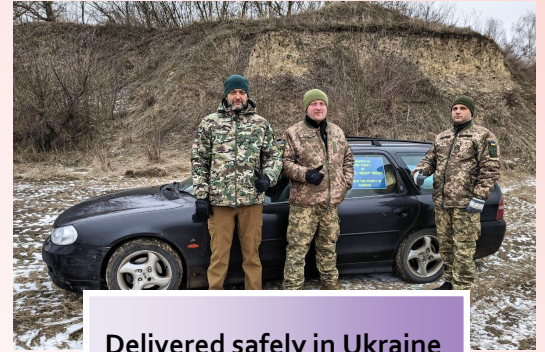
Delivered safely in Ukraine